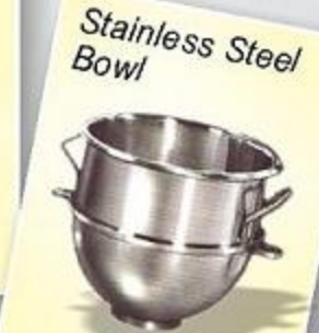
Stainless Steel Bowl