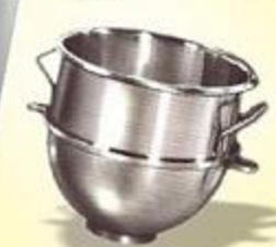
Stainless Steel Bowl