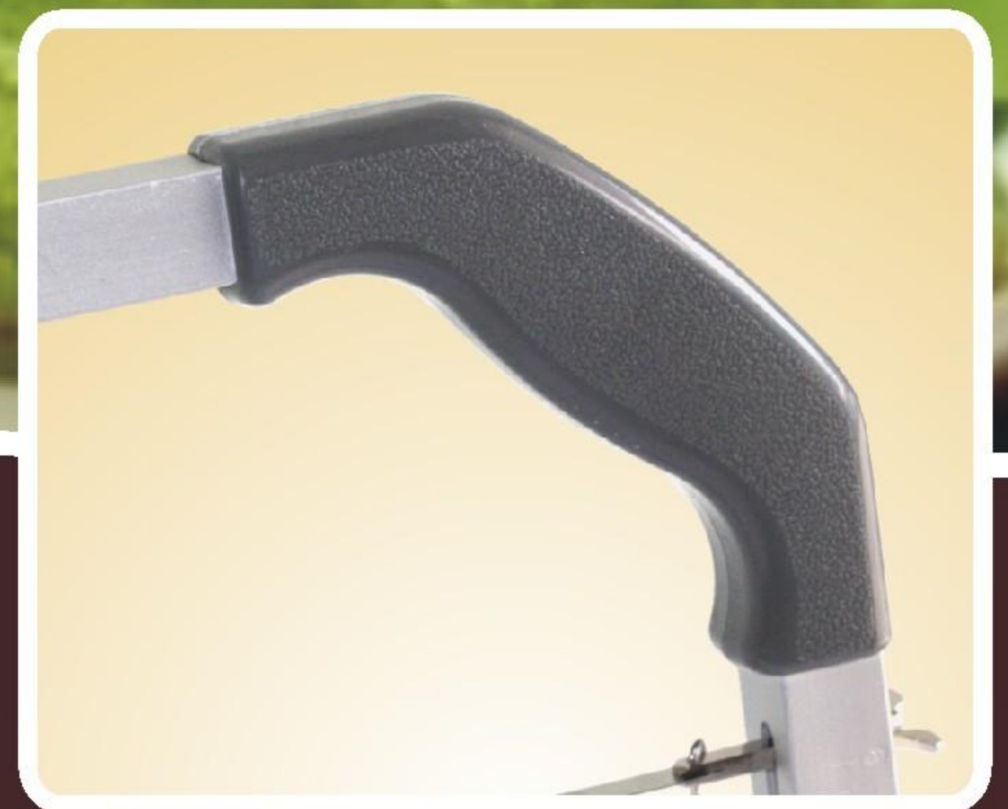
Aluminium Frame w/ Non-Slip Grip Handle