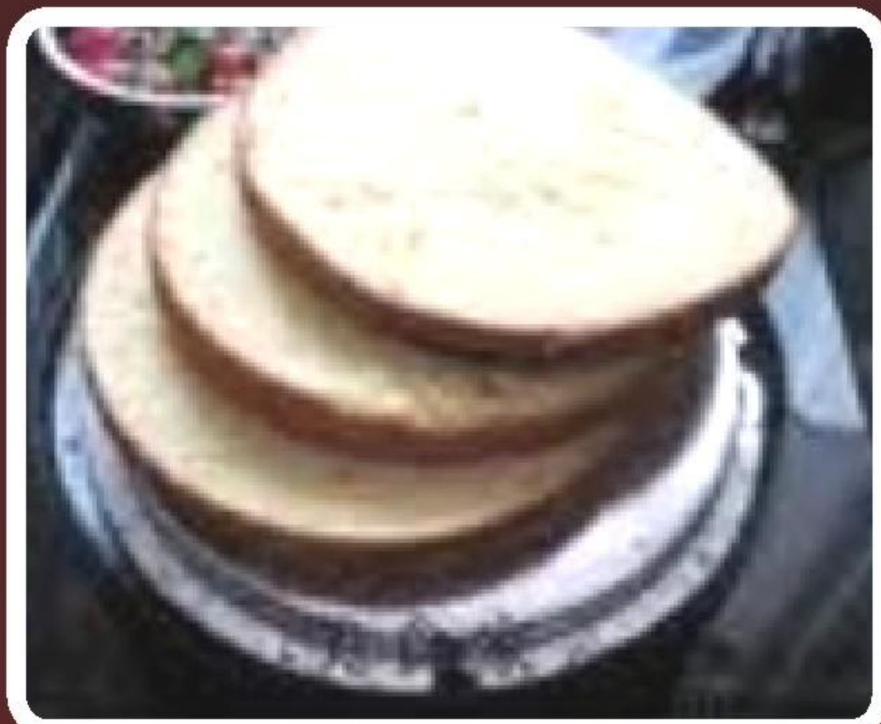
Slice Cakes into either 2, 3 or 4 layers